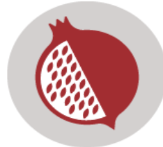
מדעי היהדות Jewish Studies