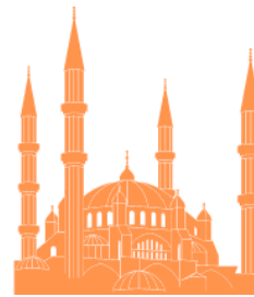
Middle East Studies